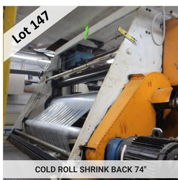
COLD ROLL SHRINK BACK 74"