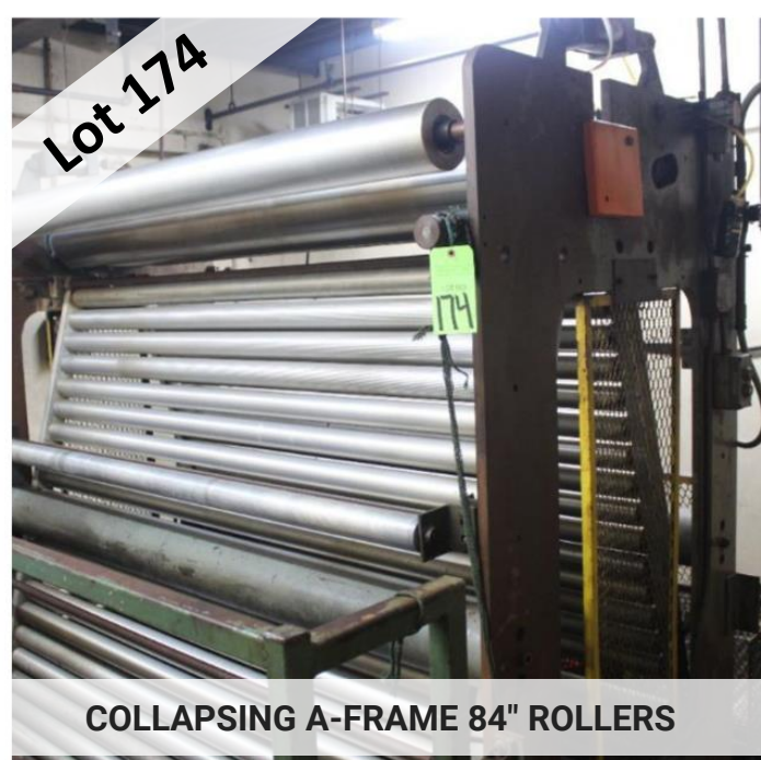
COLLAPSING A-FRAME 84" ROLLERS