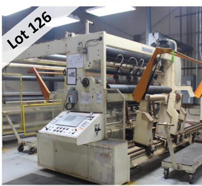
2002 EUROMAC UPVC SLITTER