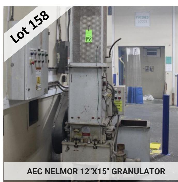
AEC NELMOR 12"X15" GRANULATOR