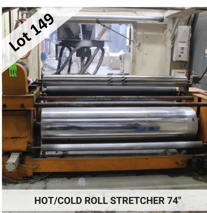
HOT/COLD ROLL STRETCHER 74"