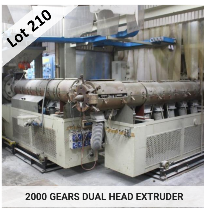
2000 GEARS DUAL HEAD EXTRUDER