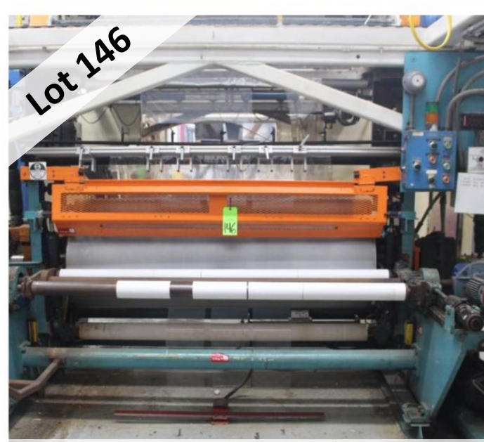
COLD ROLL WINDER 74" X 2'