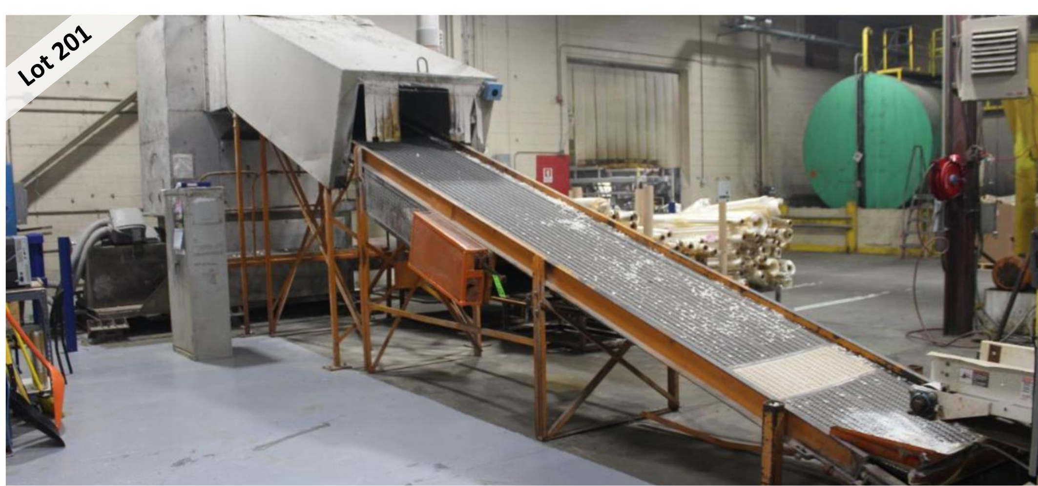
GRINDER AND CONVEYOR SYSTEM

Auction 1 of 3 from Berry Global with production lines being offered in entirety through bulk bidding. Machinery includes extruders, mixers, blenders, rollers, bagging machines and separators, hopper storage tanks and much, much more!