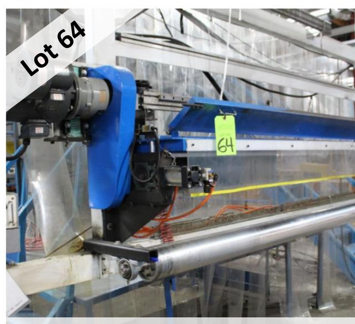
SECONDARY NIP W/ TORQUE CONTROLLER