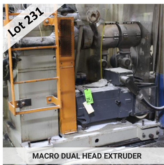
MACRO DUAL HEAD EXTRUDER