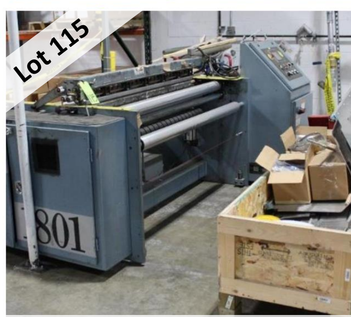
CONVERTING SYSTEMS INC. BAG MACHINE