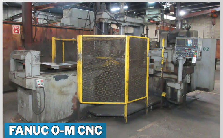
FANUC O-M CNC