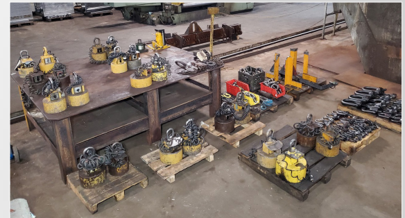
VIEW OF LIFTING MAGNETS