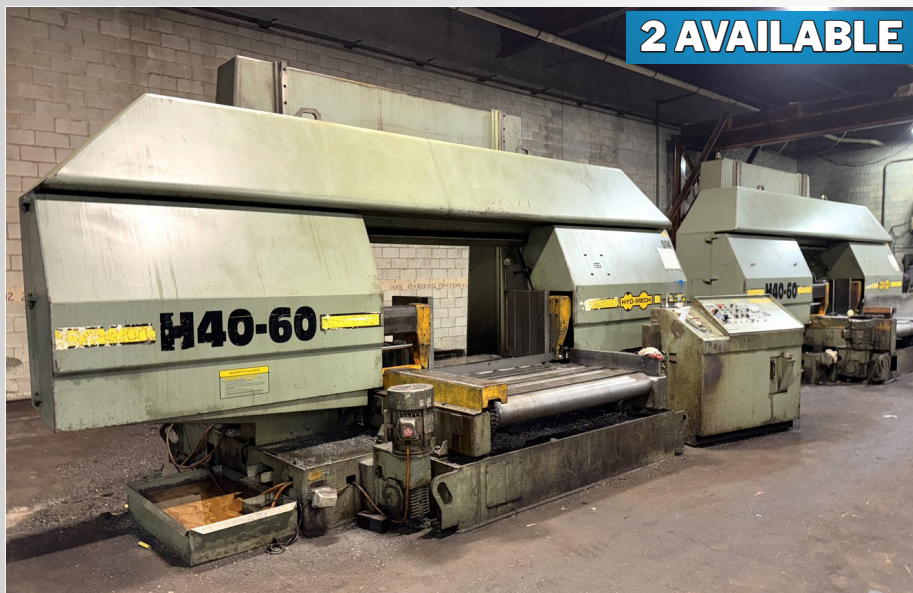
HYD-MECH H40-60 HORIZONTAL BAND SAWS