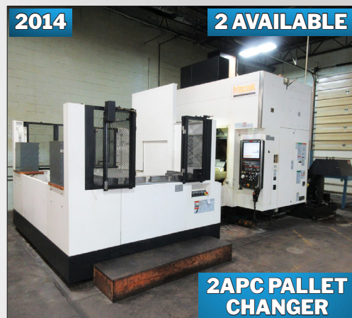
MAZAK FJV-35/60 II DOUBLE COLUMN CNC VERTICAL MACHINING CENTER