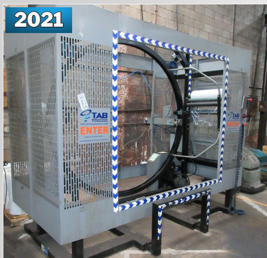
AB WRAPPER TORNADO 80" PALLET WRAPPER

2019 TAB WRAPPER TORNADO 80" PALLET WRAPPER , 9' x 4'2" x 8'6" Dimensions, 2,000Lb. Weight, 480V, s/n- 111219WT80