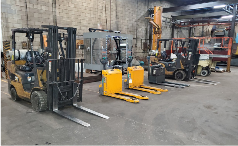
VIEW OF ROLLING STOCK