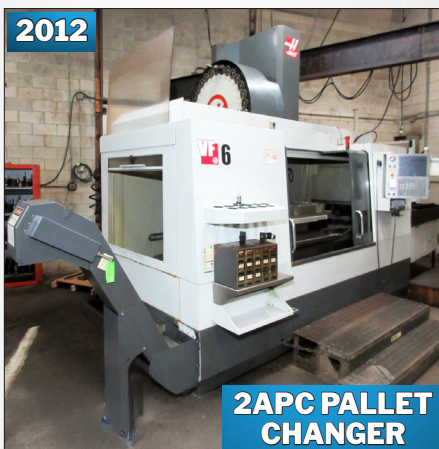
HAAS VF6/50 CNC DUAL PALLET VERTICAL MACHINING CENTER