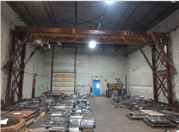
ACCO 10-TON DOUBLE LEG TRACK GANTRY CRANE