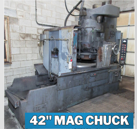
42" MAG CHUCK