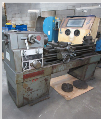
CLAUSING NO. 1401 14" X 48" ENGINE HEAD LATHE

OOYA RE-1225H 4'X15" RADIAL ARM DRILL , 48" x 25-1/2" T-Slotted Base, Approx 28" x 18" x 16" T-Slotted Box Table, 12" Stroke, 38-1985RPM Spindle Speed, s/n- N77L-4504