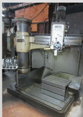
OOYA RE-1225H 4' X 15" RADIAL ARM DRILL