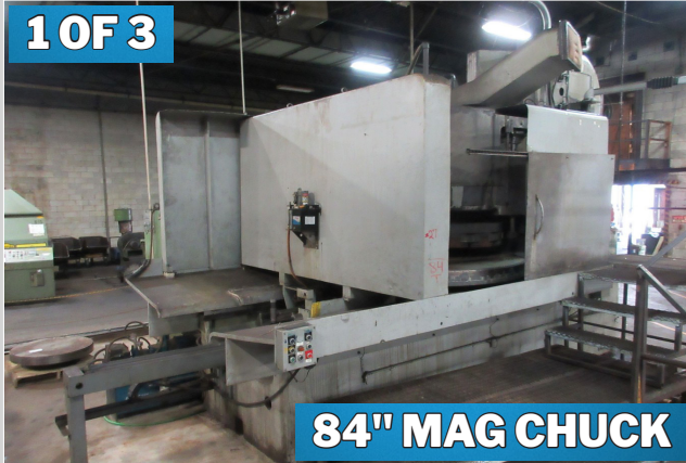
84" MAG CHUCK