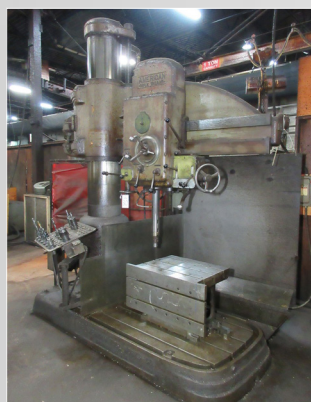
AMERICAN HOLE WIZARD 4' X 15" RADIAL ARM DRILL