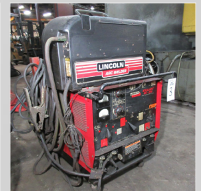
LINCOLN ELECTRIC IDEALARC DC-250 CV/CC DC ARC WELDING POWER SOURCE