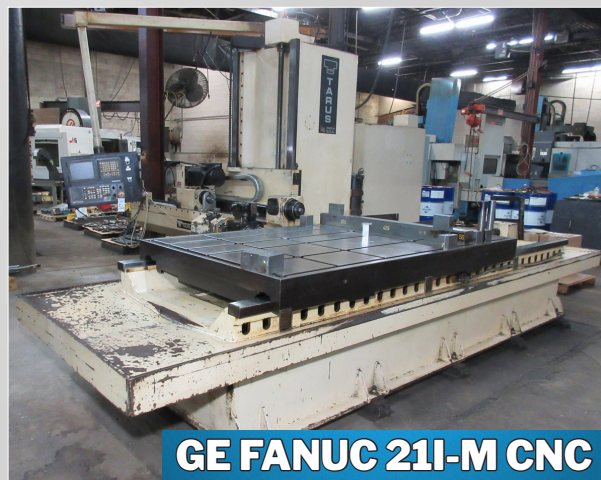
TARUS TPSXGD4896 CNC GUN DRILL

TARUS TPSXGD4896 CNC GUN DRILL , GE Fanuc 21i-M CNC Control, 1.5" Drilling Diameter Capacity, 96" x 55" Table, Travels: X-96", Y-48", Approx. 72" Drill Stroke, Gun Drill Spindle Speed to 4,000 RPM, Dual Auxiliary Spindle (Ream & Tap Heads), s/n- TPSXGDCNC 677086200