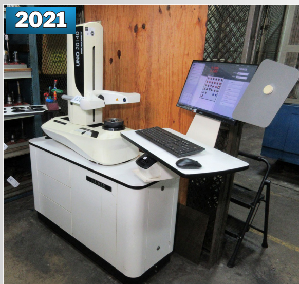
HAIMER UNO 20/40 MICROSET 50 TAPER TOOL SETTER