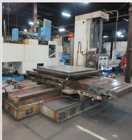
TOSHIBA BT-10BR3 TABLE-TYPE HORIZONTAL BORING MILL