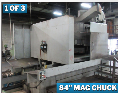
BLANCHARD 42D-84 84" ROTARY SURFACE GRINDER