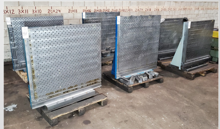
VIEW OF ANGLE PLATES