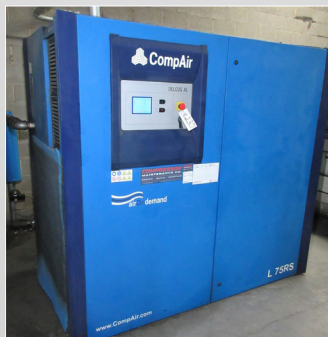
GARDNER DENVER COMPAIR L75RS-13A 75KW ROTARY SCREW AIR COMPRESSOR