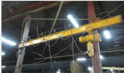
SPANCO 2-TON WALL BRACKET I-BEAM MOUNTED JIB CRANE