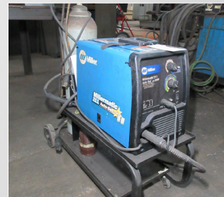
MILLER MILLERMATIC 211 AUTO-SET WITH MVP 120/230V WIRE WELDER STOCK