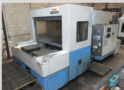
MAZAK ULTRA 650X CNC HORIZONTAL MACHINING CENTER