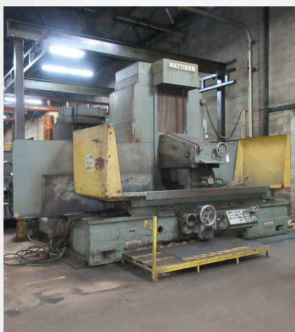
MATTISON 36" X 72" HYDRAULIC HORIZONTAL SURFACE GRINDER