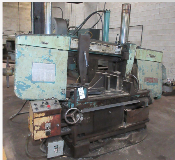
DAITO ST5070C 20" HYDRAULIC HORIZONTAL BANDSAW