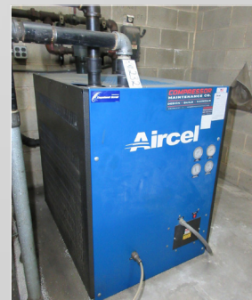
AIRCEL VF-500 REFRIGERATED COMPRESSED AIR DRYER