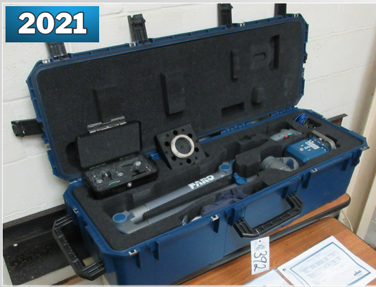
FARO 41000 PORTABLE CMM