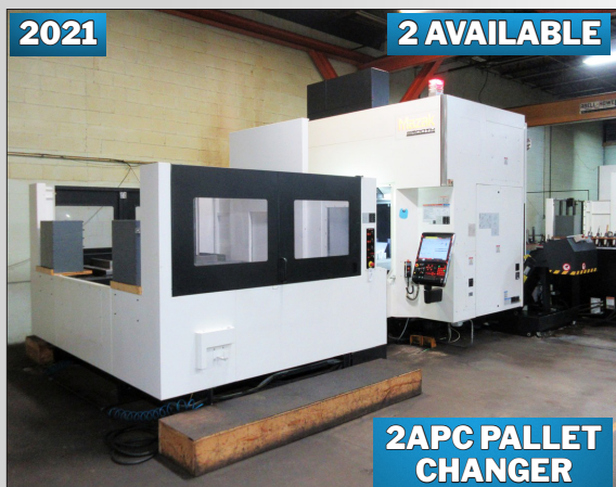
MAZAK FJV-35/60 DOUBLE COLUMN CNC VERTICAL MACHINING CENTER

Featuring 2021 Faro 41000 Portable Coordinate Measuring Machine, Complete Inspection Department with Micrometers, Height Gauges, Calipers, Granite Surface Plates, Heavy Duty Tables and Workbenches, (40+) Vidmar Cabinets, Boring Bars, Drills, Inserts, Power Tools, Vises, Lifting Magnets, Rigging Supplies, Dump Hoppers, Ladders, Rolling Cabinets, Large Quantity of Raw Steel Material and Scrap Opportunity, Office Furniture and Much More!