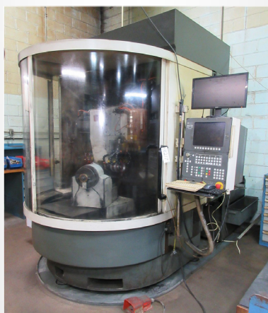
WALTER HELITRONIC POWER 5-AXIS CNC TOOL GRINDER

JUNGNER MASKIN US-2305 UTG-214 UNIVERSAL TOOL & CUTTER GRINDER , 24-1/2" x 4-1/2" T-Slotted Table, Motorized Tool Grinding Fixture, Misc. Tooling, 220V 3PH, s/n- 2791