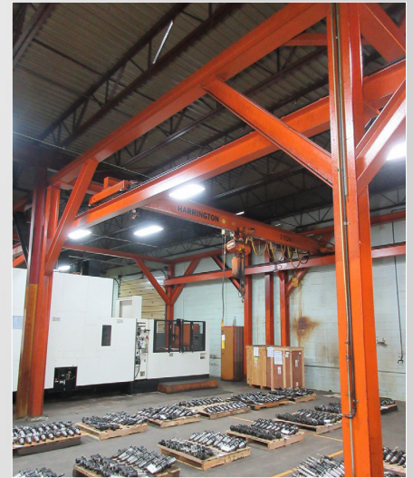
HARRINGTON 3-TON FREE STANDING OVERHEAD BRIDGE CRANE