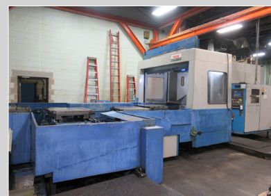
MAZAK H800 CNC 6APC HORIZONTAL MACHINING CENTER