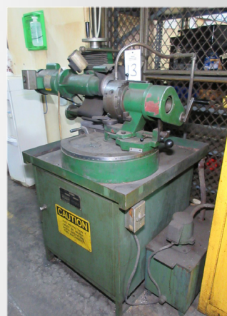
RUSH MACHINERY 250A DRILL TOOL GRINDER