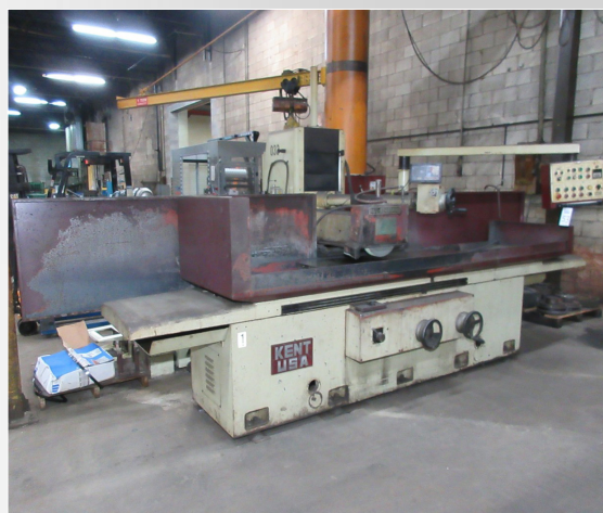
KENT SGS-S2460AHD 60" X 24" HYDRAULIC HORIZONTAL SURFACE GRINDER