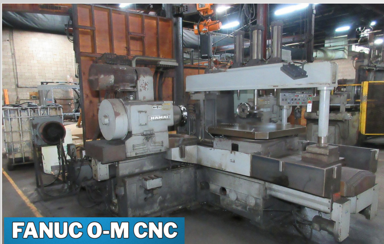
FANUC O-M CNC