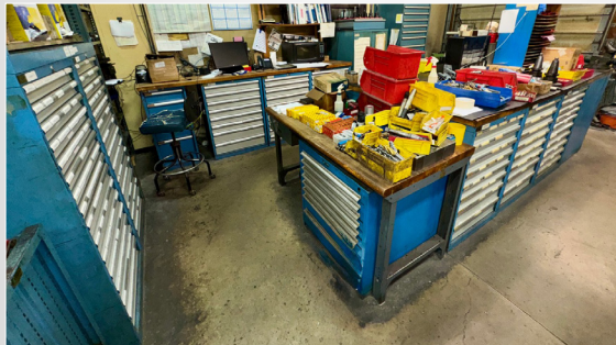
VIEW OF VIDMAR TOOL CABINETS