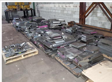
VIEW OF RAW STEEL