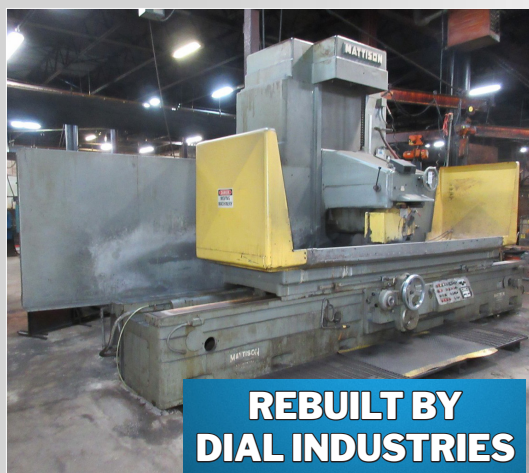
MATTISON 36" X 96" HYDRAULIC HORIZONTAL SURFACE GRINDER