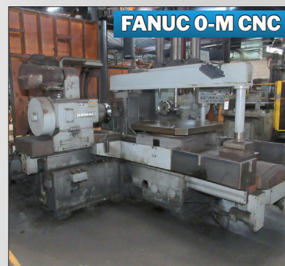
HAMAI 6DS-A CNC DUPLEX MILLING MACHINE

Assets Location: Harrisburg, Pennsylvania