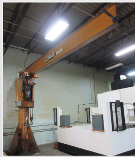
ABELL-HOWE 3-TON FREE STANDING JIB CRANE

GARDNER DENVER ELECTRA-SAVER II ECMQLB 75HP ROTARY SCREW AIR COMPRESSOR