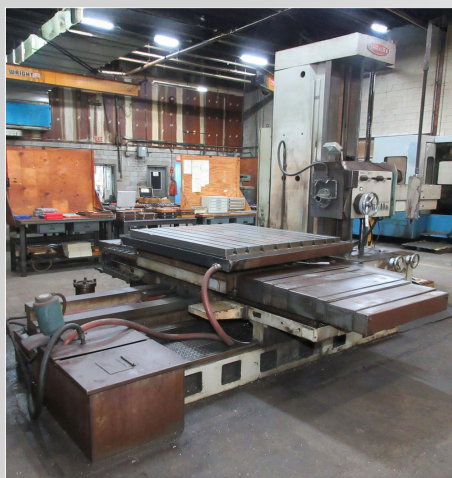
TOSHIBA BT-10BR3 TABLE-TYPE HORIZONTAL BORING MILL