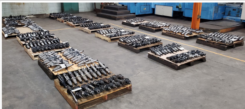
LARGE QUANTITY OF CAT 50 TOOL HOLDERS