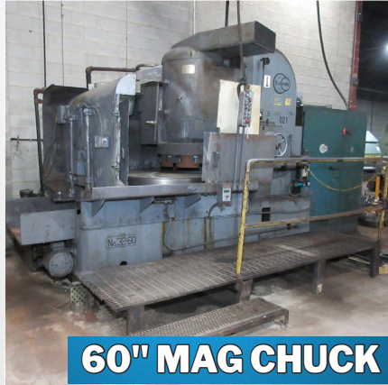
60" MAG CHUCK