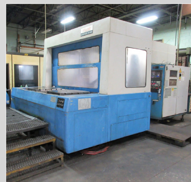
MAZAK H800 CNC HORIZONTAL MACHINING CENTER