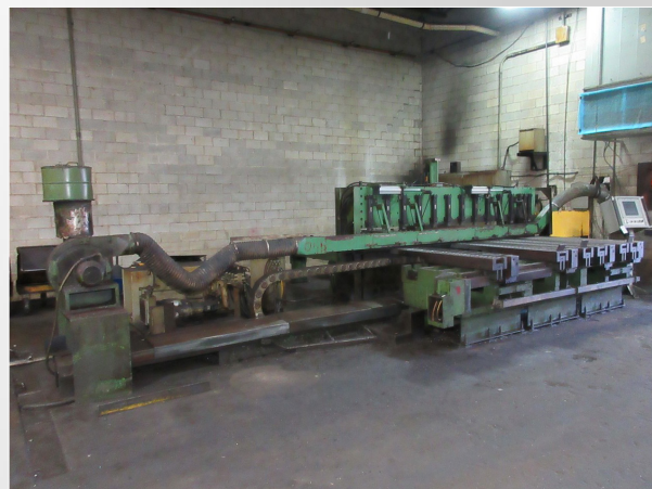
OLIVER 879 PLATE SAW

OLIVER 879 PLATE SAW , 8" Plate Thickness Capacity, 156" Wide Opening, Dust Collection System, 10HP Hydraulic Power Unit, Lubriquip Trabon Maxi-Monitor Mark III Universal Controller, Touch Screen HMI, s/n- 203827