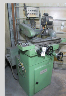
JUNGNER MASKIN US-2305 UTG-214 UNIVERSAL TOOL AND CUTTER GRINDER