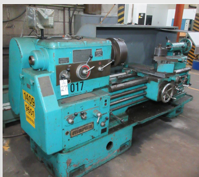
K. MARTIN TYPE DLZ 702 28" X 45" ENGINE HEAD LATHE