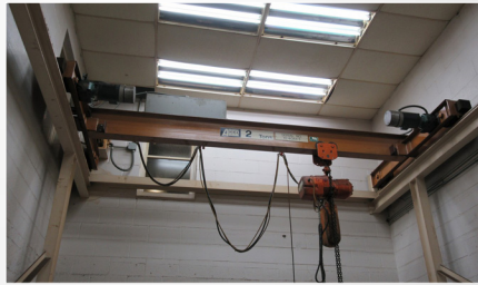
ACCO 2-TON BRIDGE CRANE