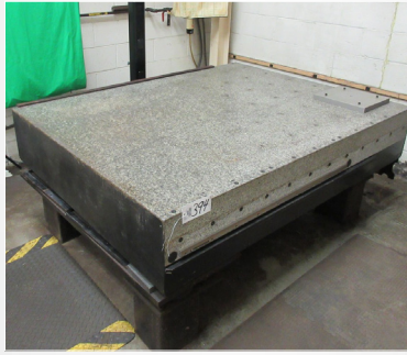
TRU-STONE 71" X 53" X 12" GRANITE SURFACE TABLE