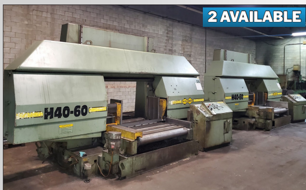
HYD-MECH H40-60 HORIZONTAL BAND SAWS