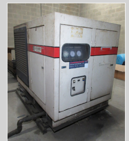
GARDNER DENVER ELECTRA-SAVER II ECMQLB 75HP ROTARY SCREW AIR COMPRESSOR