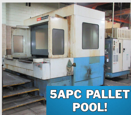
MAZAK FH 8800 4-AXIS CNC HORIZONTAL MACHINING CENTER

MAZAK H800 CNC HORIZONTAL MACHINING CENTER , Mazatrol M32 CNC Control, 49" x 39" x 33" Travels, (2) 32" x 32" Pallets, 120-Position Automatic Tool Changer, CAT 50 Taper, Chip Conveyor, S/N 92750 [1990]