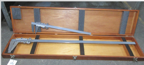
(2) MITUTOYO VERNIER CALIPERS