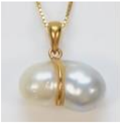
653. A 9ct gold pearl pendant with a chain, 3.4g