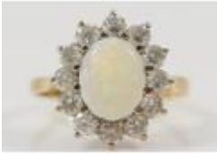
421. A 9ct gold opal and white gemstone cluster ring, Q, 3.7g