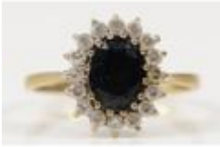
422. A 9ct gold sapphire and diamond cluster ring, M 1/2, 2.2g