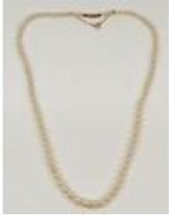
725. A 9ct gold clasp cultured pearl necklace, 14.6g