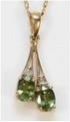
654. A 9ct gold diamond and green gemstone drop pendant with a chain, 18mm, 2.5g