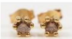
732. A pair of 9ct gold diamond earrings with scroll backs, 0.9g