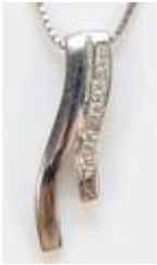
655. A 9ct white gold diamond drop pendant with a chain, 18mm, 2.1g