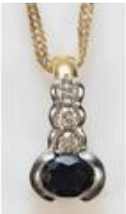
657. A 14K white and yellow gold diamond and sapphire pendant with a chain, 3.1g