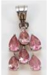
656. A 9ct white gold pink gemstone pendant, 18mm, 2.2g