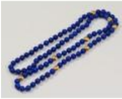
726. A 14K gold lapis lazuli beaded necklace, 6mm beads, 44.2g