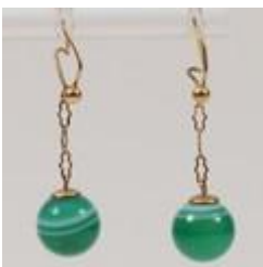
730. A pair of 9ct gold polished green agate drop earrings with hooks, 28mm drop, 3.3g