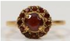
729. A 9ct gold garnet cluster ring, N, 2g