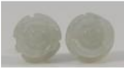
727. A pair of 14K gold carved jade rose earrings with scroll backs, 10mm, 1.9g