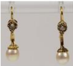
728. A pair of 15ct gold cultured pearl and diamond drop earrings with hooks, 17mm drop, 1.8g