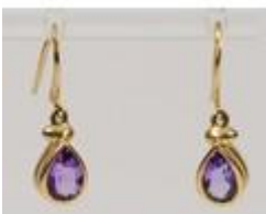
731. A pair of 9ct gold amethyst drop earrings with hooks, 1.8g