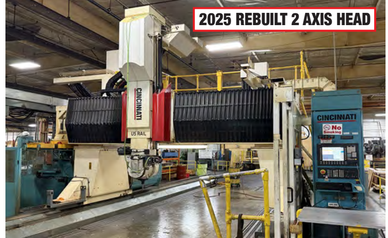
2025 REBUILT 2 AXIS HEAD