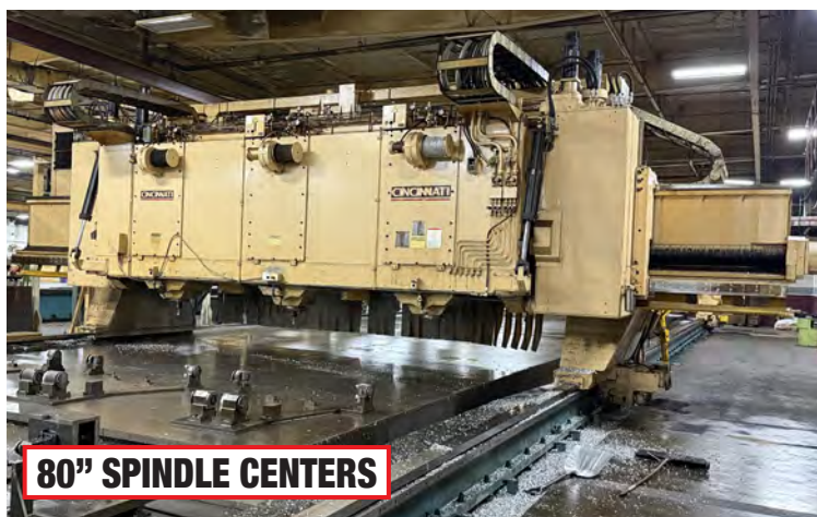
80" SPINDLE CENTERS