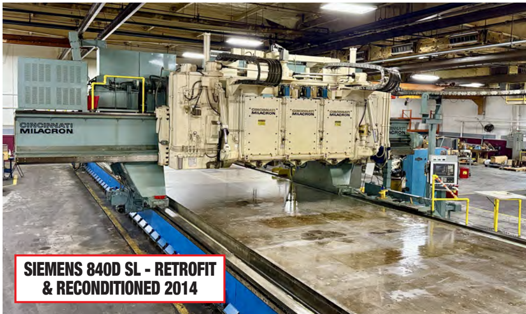
SIEMENS 840D SL - RETROFIT & RECONDITIONED 2014