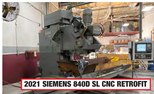
2021 SIEMENS 840D SL CNC RETROFIT