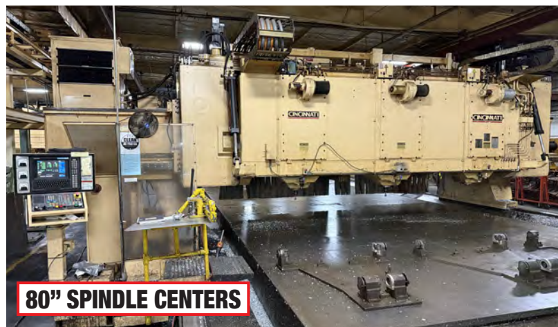
80" SPINDLE CENTERS