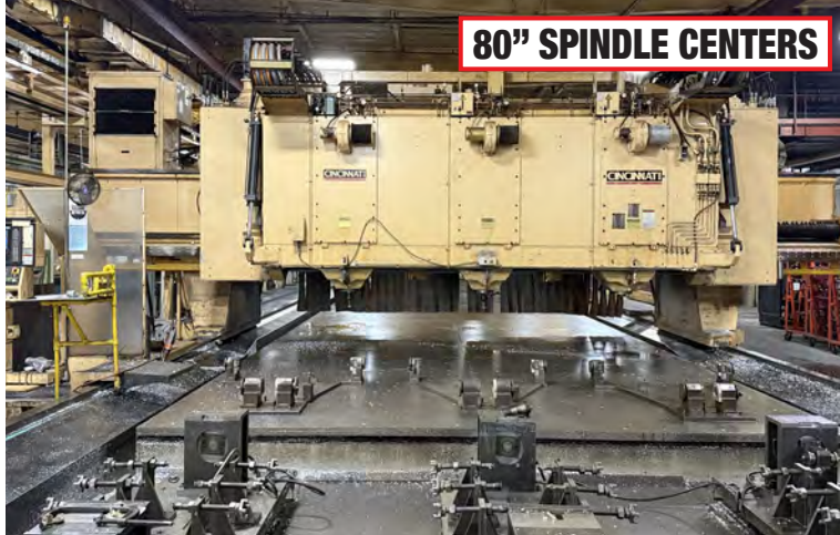
80" SPINDLE CENTERS