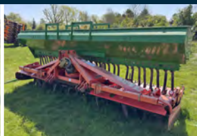
LOT: 157 & 158